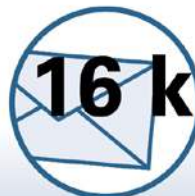
Kern 1600 fast