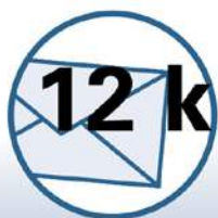
Kern 1600 flex

New functions, such as speed adjustment and preventive error handling are a great added value for our customers to increase production efficiency.